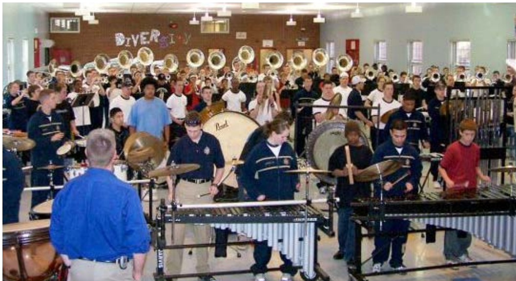
The 7 th Regiment and the Naval Academy Drum & Bugle Corps together enjoying one great jam session... (Look at all those Contras...!!!)

Activities started with the Naval Academy D & B and the 7 th in sectional practices, after which both full corps joined together and played selections from the 7 th 's upcoming 2005 show. To view a full compliment of 33 photos of this memorable day, visit on the web... www.7thregiment.org . A barbeque dinner followed the dual practice, in which the SAA Alumni and volunteers prepared and served about 150 dinners. The evening was capped off for the 7 th Regiment, the SAA, and the volunteers as they were once again treated to musical selections by the Naval Academy D & B, after which they boarded 2 coach buses and headed for Massachusetts. A BIG "Thank You" goes out to Jeff and all the Naval Academy D & B members for providing the 7 th Regiment with a memory that will last a life time.